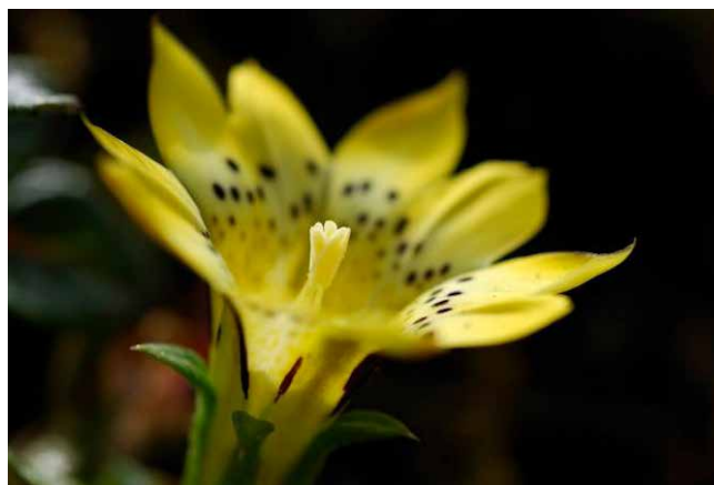
Gentiana scabrida Hayata. By Chun-Kuei Liao. CC-BY-NC.

Over 100,000 records of plant specimens from the island of Taiwan have been published via the GBIF portal. The dataset, with records dating back to 1895, includes endemic species such as Gentiana scabrida Hayata, Cycas taitungensis , Begonia chitoensis and Gastrochilus fuscopunctatus . Data are from the collections of the herbarium at the National Taiwan University, which holds representative specimens of about 95 per cent of species of vascular plants in Taiwan. Most of the collection of 260,000 specimens has been digitized.