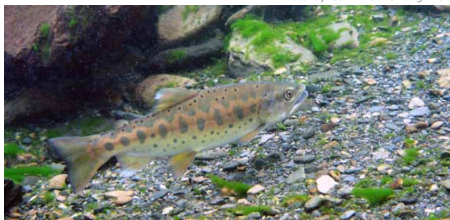
Oncorhynchus formosanus , an endemic species from Taiwan

The national Chinese Taipei e-Learning and Digital Archives Program (TELDAP), which aims to promote national digital archives and e-learning applications for the development of Chinese Taipei, has already accumulated a large amount of biodiversity information from various databases, and this will feed into TaiEOL. The Forestry Bureau will also provide information on 4,000 native vascular plants.