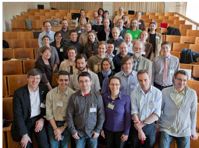
Participants at the European nodes meeting

The fourth meeting of European nodes was held from 27 to 29 March at the Botanic Garden and Botanical Museum Berlin-Dahlem and the Museum für Naturkunde, Berlin. It involved 55 participants from 13 countries and three organizations.