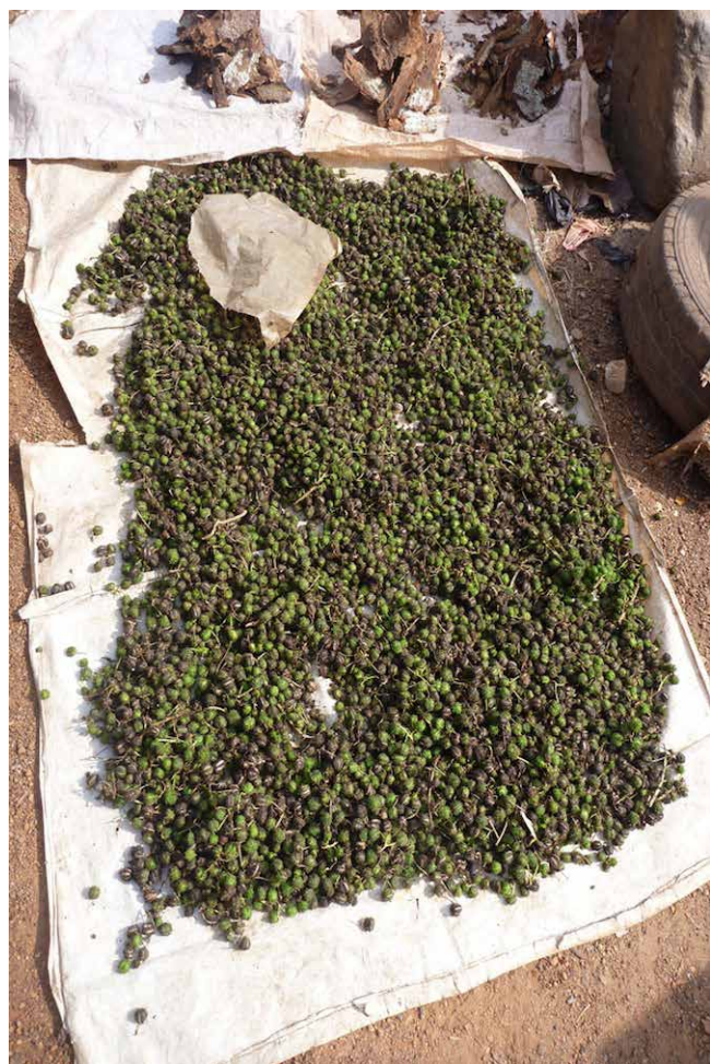
Sun drying of Piper guineense fruits at Bode Market in Ibadan, Nigeria.

Wild-harvested medicinal plants are an important source of health and trade for people in sub-Saharan Africa. By combining quantitative surveys of herbal markets in Ghana and Benin with the first detailed distribution maps for 12 commercially extracted medicinal plants (which draw upon GBIF-mediated data), this study assesses the potential vulnerability of species to overharvesting with the goal of safeguarding important provisioning services of West African ecosystems.