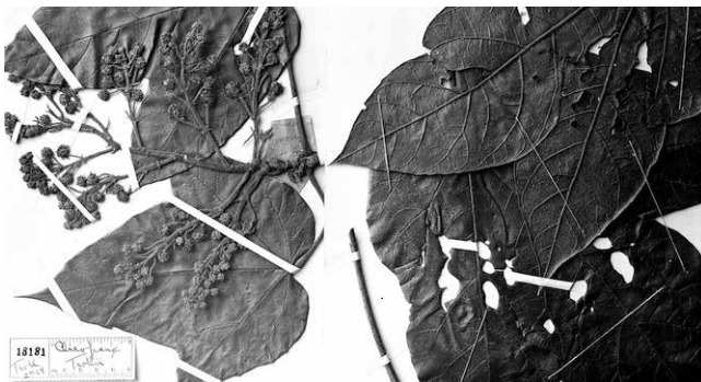
Image of type specimen of Oreopanax trollii Harms.

The Botanic Garden and Botanical Museum Berlin-Dahlem has published a dataset with more than 15,000 photographs of type specimens collected in Central and South America between 1778 and 1930. The images are the work of botanist J. Francis Macbride , whose photographs of these tropical American plants in European herbaria became even more valuable when parts of the collections were destroyed during World War II.