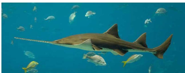
Sawfish ( Pristis pectinata ).

To assess and address potential inconsistencies in three common methods for modelling potential climate impacts, a broad international team used GBIF-mediated data from plant communities in arctic and alpine North America and Europe to analyse predicted changes in community composition. Results from in situ experimental warming and monitoring approaches yield consistent estimates of the communities' magnitude of response to contemporary climate warming, while inferences based on present-day patterns of ecological systems tend to overestimate them.