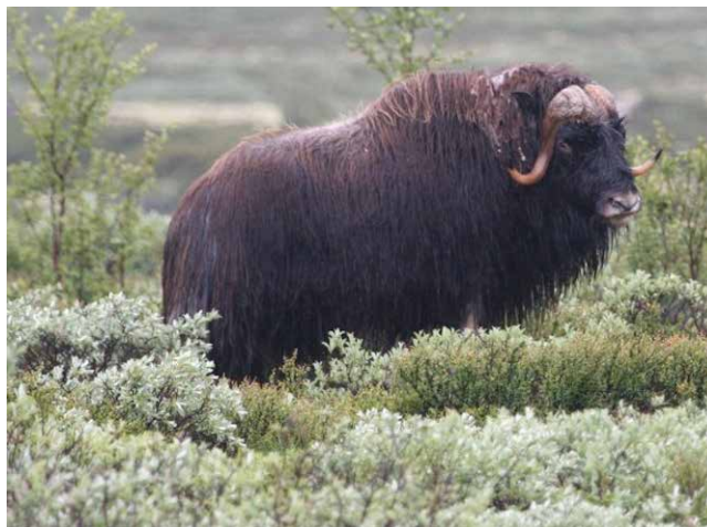
Musk ox ( Ovibos moschatus ).

The dataset’s dynamic growth is due in large part to Norway’s Artsobservasjoner portal, which gathers observations from 9,000 volunteers, who report an average of 5,000 observations each day. Artsobservasjoner currently holds 12 million records on over 14,000 species, along with more than a quarter million images. These data feed into the Species Map Service , which shares more than 19 million species occurrence records related to over 31,000 species, provided by 34 Norwegian source institutions.