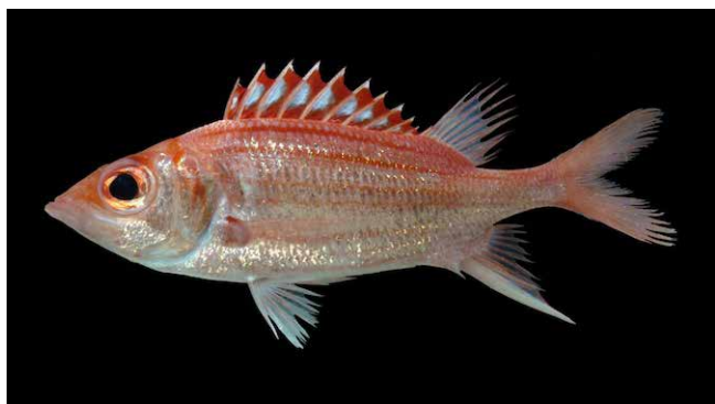
Holotype of Neoniphon pencei, Rarotonga, Cook Islands