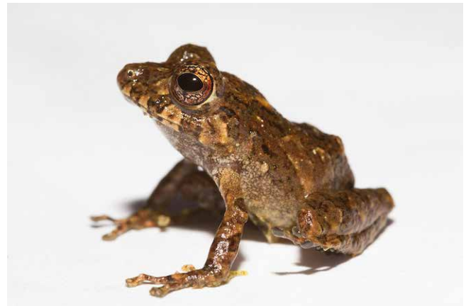
Pristimantis cruentus .

To address the time-consuming and complex process of compiling and preparing data for analyses and prediction of species distributions, the researchers describe the design and implementation of a Taverna-based data refinement workflow for retrieving, cleaning and selecting taxonomic data from sources including GBIF.org and the GBIF API.