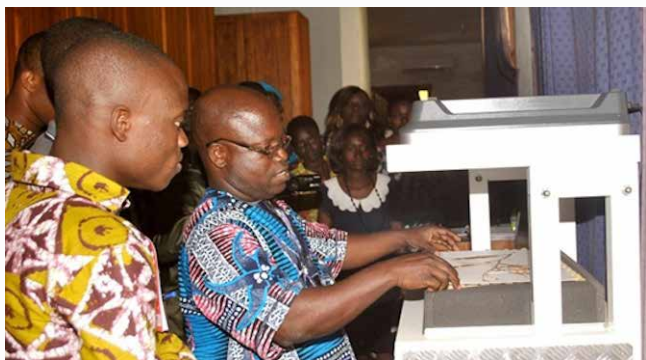
Specimen digitization workshop.

The European Union (EU) and GBIF have launched a four-year €3.9 million project aimed at increasing the amount of biodiversity information available for developing countries.