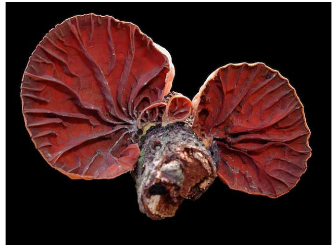
Anthracophyllum archer , from ALA’s Fungi map

Fungimap, one of the largest citizen science groups in Australia, has been around for 20 years, but recent support from the Atlas of Living Australia (ALA), GBIF’s national node, has helped deliver its data to a wider audience.